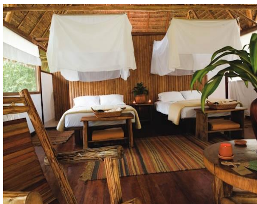
Typical accommodation at Inkaterra Reserva Lodge

Take a 20-minute ride by outboard motorized canoe to the Inkaterra Canopy Walkway Interpretation Center where you will learn about its construction and the conservations projects of ITA-Inkaterra Association (NGO). Ascend one of the two 98-foot towers and cross the 7 hanging bridges that connect the treetops to 91-feet high. Enjoy the breathtaking vistas and get the chance to watch white-throated toucans ( Ramphastos tucanus ), woodpeckers, trogons, squirrel