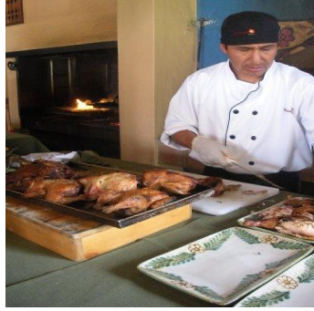
Wayra Ranch from Sol Luna