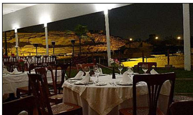
Huaca Pucllana Restaurant ... lighted ruins in background

Stops include the main plaza of Lima, upon which sits the Government Palace, the Cathedral, the Archbishop's Palace and the City Hall; next on the itinerary is a visit to Santo Domingo Convent. Once finished there, we'll be off to the modern district of San Isidro and then to we'll stop at the “ Parque del Amor ” (a sort of lover's lane/park) with its incredible view of the Pacific Ocean. Tonight you will enjoy an exquisite welcome dinner at Huaca Pucllana Restaurant , set next to pre-Incan ruins which are lighted and beautifully displayed at night.