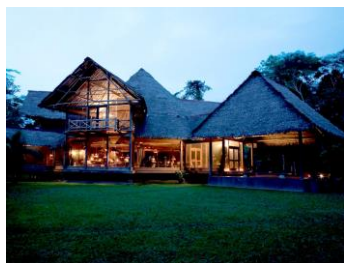
Inkaterra Reserva Amazonica

(Butterfly House), where the staff will welcome you and give you the necessary information for your stay. Navigate by outboard motorized canoe along the Madre de Dios River to Inkaterra Reserva Amazonica