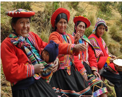
Misminay local women

Today, we will visit the Andean community of Misminay, in the outskirts of Cusco, where you will be able to spend the day with the tradition-preserving locals.