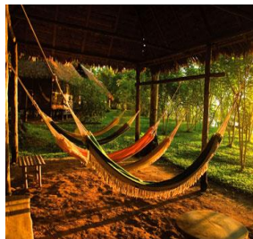
Hammocks for relaxing