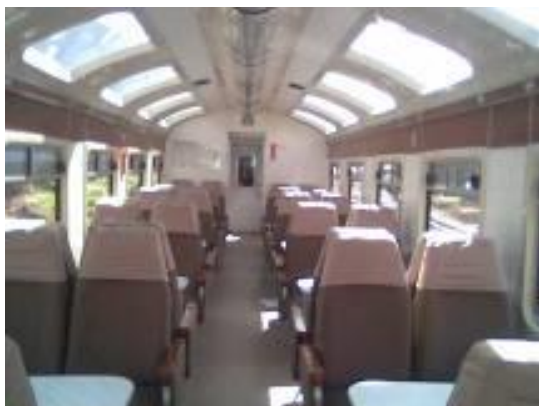
Vistadome Train interior

After breakfast, we will board the Vistadome train to the Aguas Calientes Station in Machu Picchu where you will be transported by bus to the top of the mountain and the citadel of Machu Picchu, one of the most renowned examples of Inca architecture in the world. You'll be amazed to discover that you are surrounded by lush cloud forest and many ferns and wild orchids. Lost in history, it was not discovered until 1911 by the American explorer Hiram Bingham. After a guided visit of the ruins, you will have a self-service lunch at a local restaurant. The balance of the afternoon is free for you to marvel at the ruins and discover more of this incredible city on your own. Dinner is included at the hotel. Overnight at El Mapi Hotel by Inkaterra (3*) Meals included: Breakfast – Lunch – Dinner