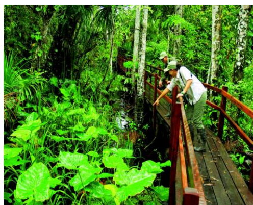
Inkaterra Canopy Walkway

New experiences are ahead and after your nutritious buffet breakfast, get ready for a long trek through terra firma into the Tambopata National Reserve towards lake Sandoval. Here you will understand why Madre de Dios is called the biodiversity capital of Peru, while learning about the Reserve's conservation efforts and the lake's formation. Navigate by dugout canoe across this irror-like oxbow lake that is home to the endangered giant river otter ( Pteronura brasiliensis ), blue and yellow macaw ( Ara ararauna ), red howler monkey ( Alousatta seniculus ), black caiman ( Melanosuchus niger ) and one of the world's biggest fresh water scaled fish, the paiche ( Arapaima gigas ). Back to the lodge for lunch and later on the Inkaterra Canopy Walkway and Anaconda Walk awaits.