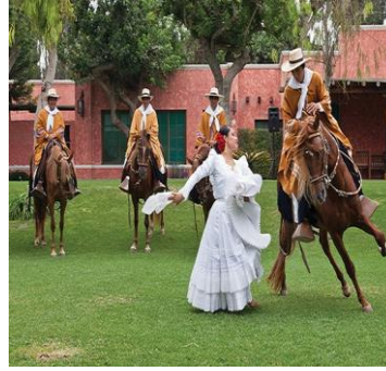
Peruvian Pazo Horse show with Marineria