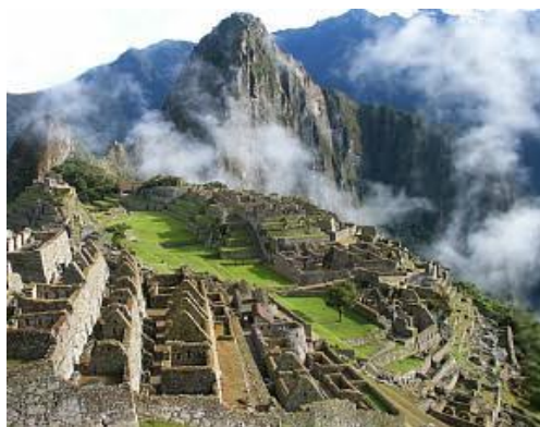
Machu Picchu with Huayna Picchu in background