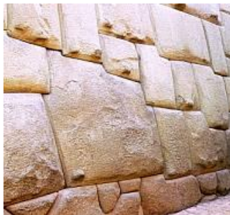
Marvelous masonry of Sachsahuamán