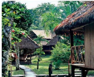
Inkaterra Reserva Amazonica