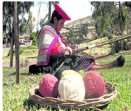
Misminay woman using ancient loom technique

The tour to the village goes through native botanical species, crop fields, using a narrow and winding path that will take us to the village. There is a natural balcony with a spectacular view of the Sacred Valley of the Incas and the snow-covered mountains in the background. Families live