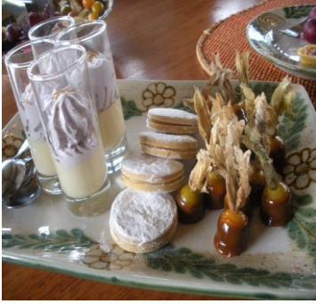
Wayra Ranch from Sol Luna demonstration

have time to explore the town and then we'll continue on to Wayra Ranch from Sol Luna, where you will enjoy a lovely lunch and then an incredible, unforgettable Peruvian Pazo Horse show.